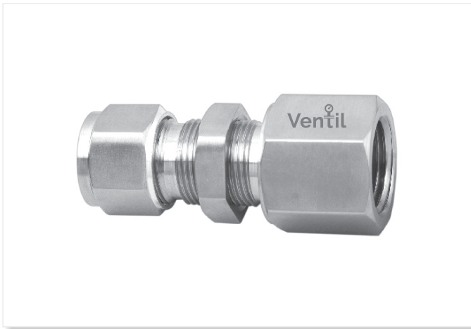
Dimensional Details :